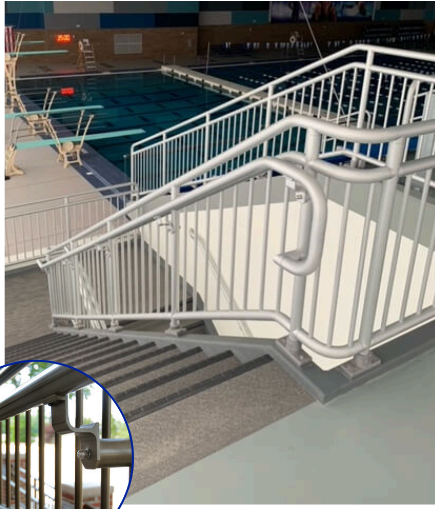
Series 5P Pipe Picket Railing with 5A Assist Rail