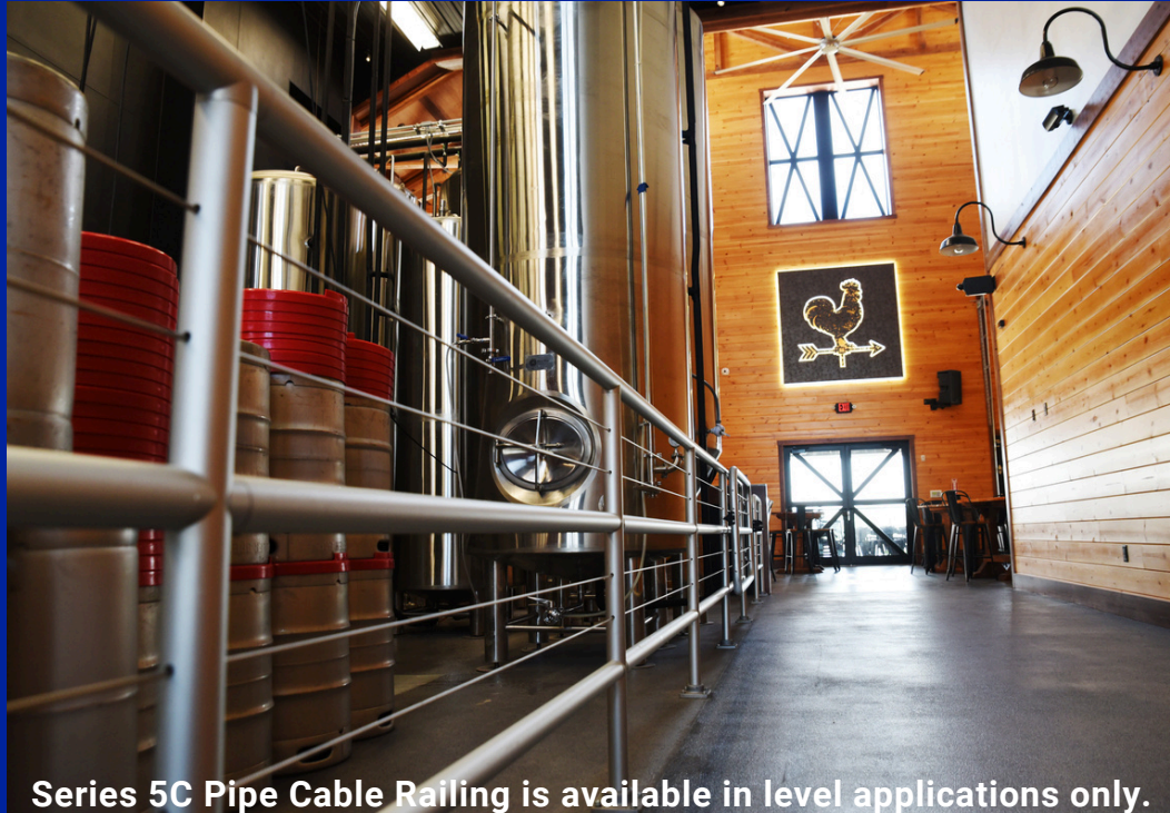
Series 5C Pipe Cable Railing is available in level applications only.