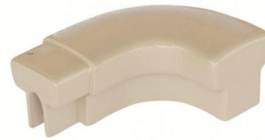
LEFT HAND SHOWN