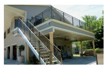
Series 9P Picket Railing